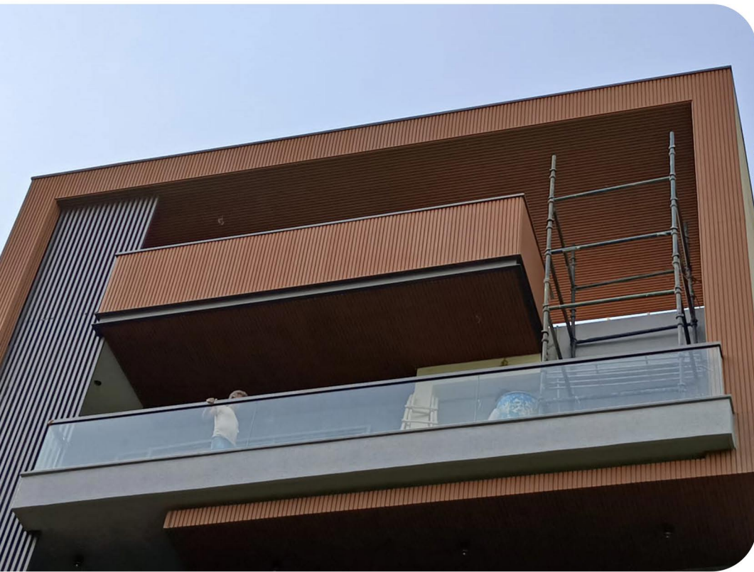
SUSHANT LOK 1, GURGAON, HARYANA

DON'T JUST TAKE OUR WORD, SEE THE ACTUAL SITE PHOTOS