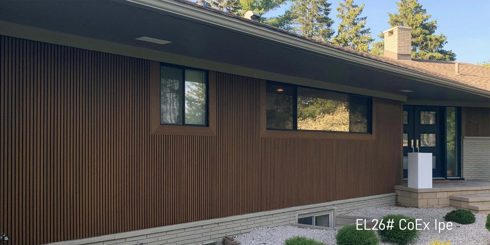
EL26# CoEx Ipe