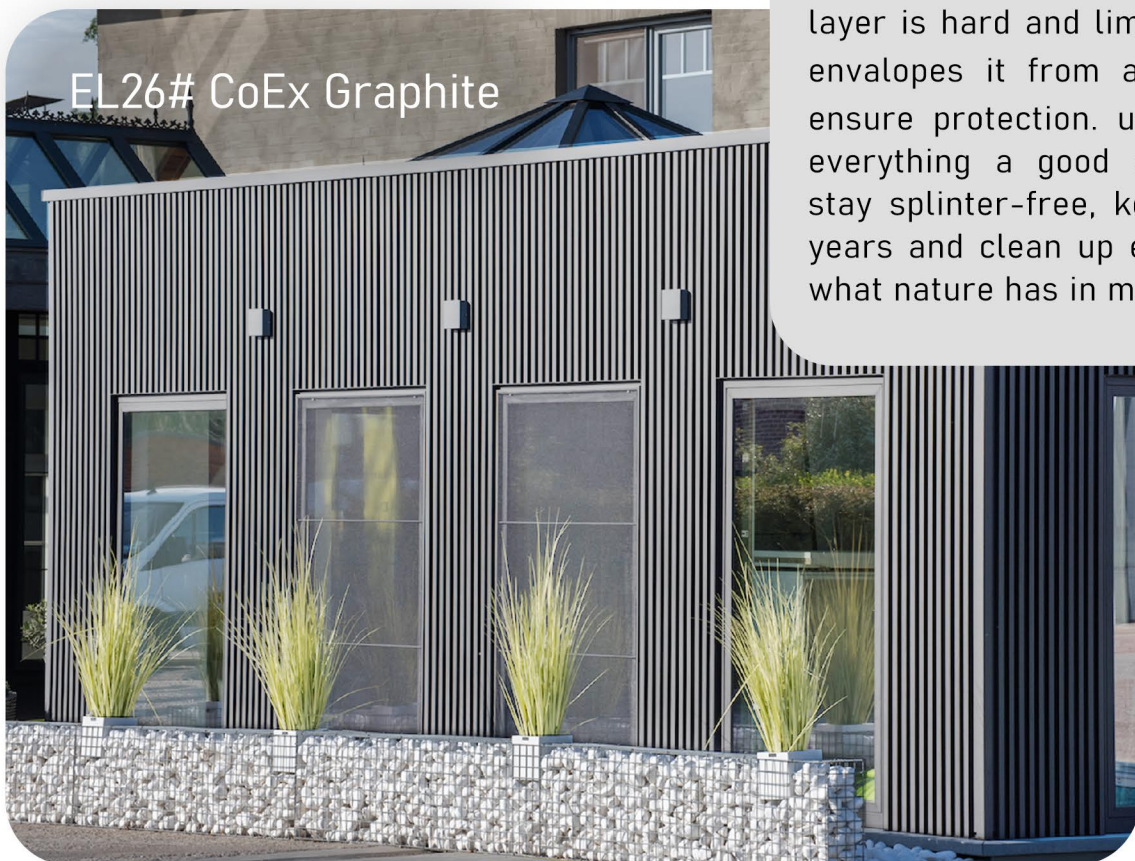
EL26# CoEx Graphite

ultimaFLUTE has a unique character that perfectly imitates real wood. The surface of the board has irregularities that catch the light and give it rhythm. This board has a new co-extrusion hard cap that is highly resistant to stains and uv rays. The protective layer is hard and limits abrasion and envelopes it from all four sides to ensure protection. ultimaFLUTE does everything a good cladding should: stay splinter-free, keep its color for years and clean up easily, no matter what nature has in mind.